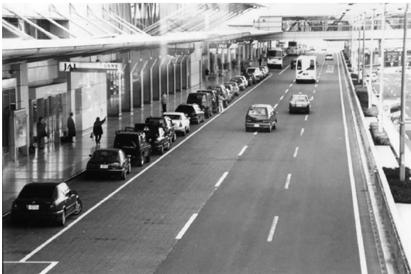
airport terminal / so

In this part, you can move to the next question by clicking on Next . If you want to return to a previous question, click on Back . You will have 8 minutes to complete this part of the test.